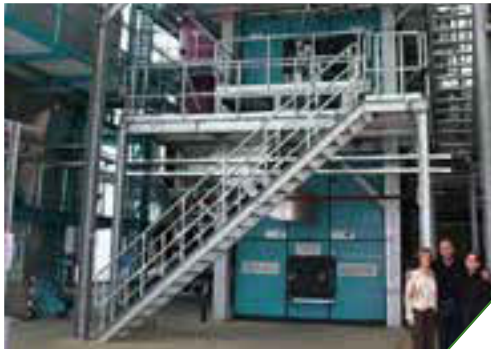
Image detailing a 7.8 MWth CHP plant in the Netherlands

Our global service network and its trained engineers and service personnel are available 24 hours a day throughout the year over the globe.