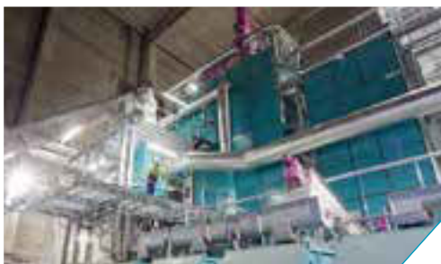
Image detailing the fuel feed and de-ashing systems of 3 MWe Steam CHP plant

One of the advantages of biomass is that it's in plentiful supply. Using it creates a demand for material that is often dumped in landfill, openly burned or left to rot. This in turn stimulates the economy at a local, regional and national level.