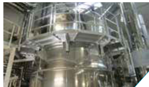
Image detailing the thermal oil heat exchanger of an ORC CHP plant

The standard thermal output of our boilers ranges from 300 kW to 30 MW per unit, with power plants ranging from 200 kW to 20 MW electric. Advanced emission control and heat recovery ensure highest efficiencies and minimum environmental impact.