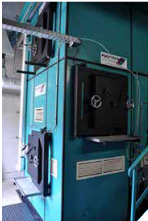
Image detailing the 1 MW R&D plant

Our credentials are a result of huge experience gleaned through 50 years, over 2,500 installations, intensive R&D, and continuous customer feedback.