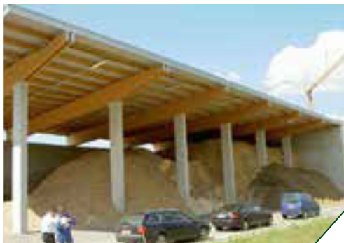
Image detailing the covered fuel yard of the dairy plant