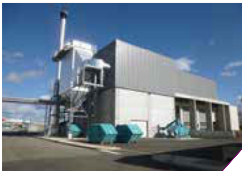
Boiler house with emission control system and fuel bunkers