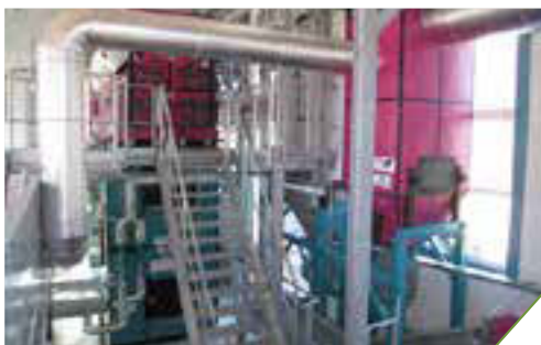
2 MW heat plant with combustion air preheater